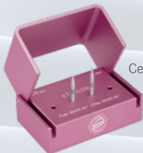
CeraTip Tissue Trimmer Kit - 4561