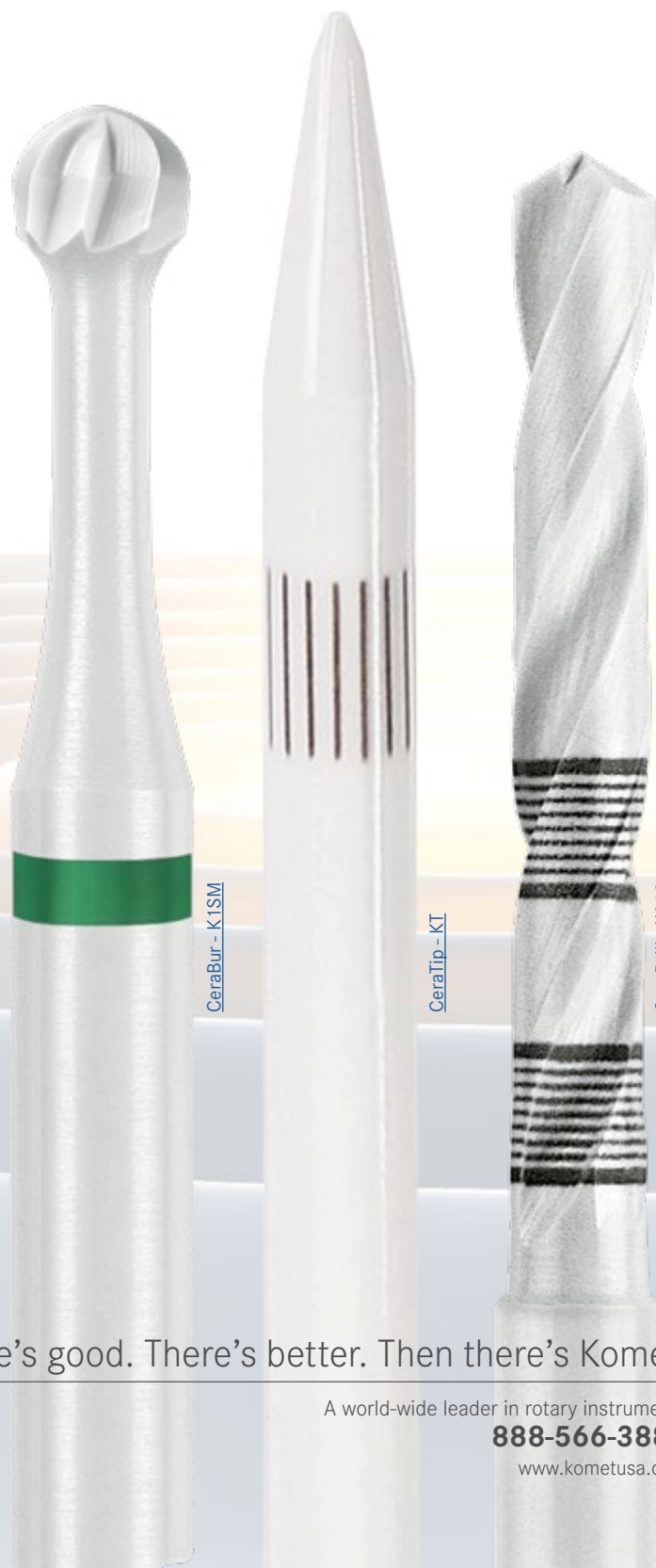
Cerabur - K1SM