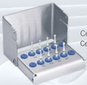
Cerabur Latch Starter Kit Ceramic Excavation Kit - LD1030

An innovative, high-performance range of white ceramic instruments